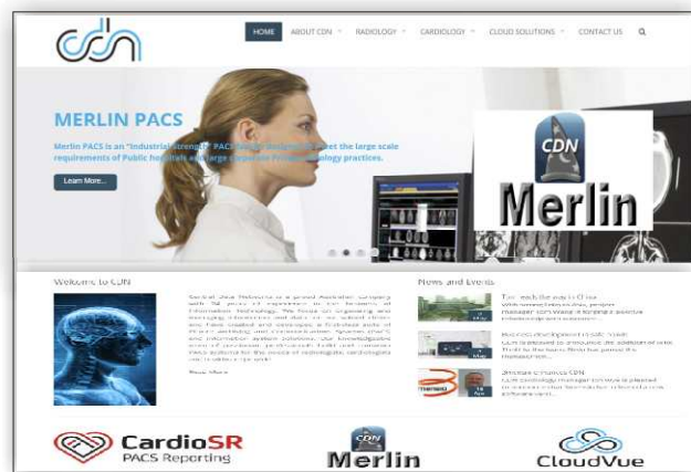
CDN's website is attracting positive attention.

“We continue to be impressed with the number of people viewing our site,” she said. Log onto www.cdnps.com.au for more info.